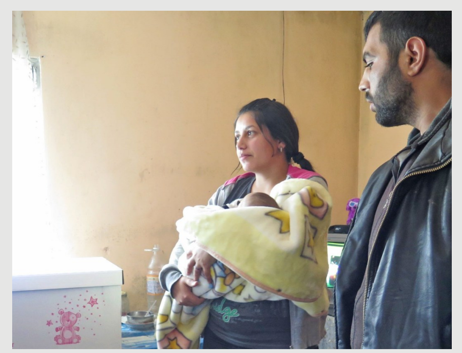
A Baby Box is given to a Roma family by the Bulgarian Mission Possible team

Whilst tensions have decreased in the city, any mention of the Roma generally brings frowns along with stories of disrespectful, system-abusing, unwanted