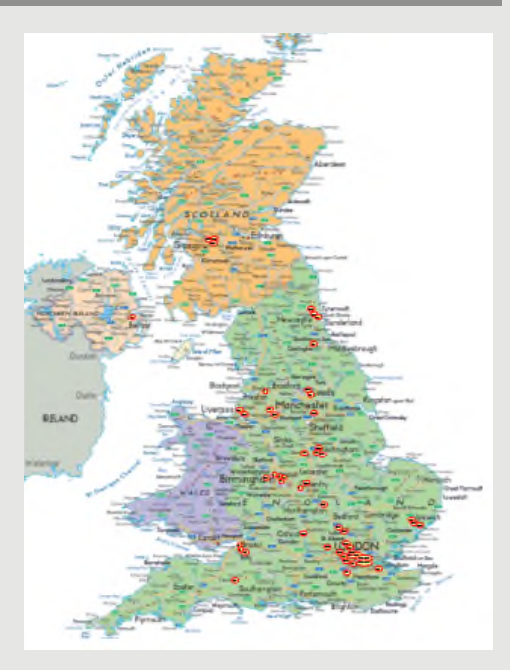
In the last 15 years, some 80 Romanian churches have been established in the UK (shown in red).

Emmaus Church, Birmingham, is at the centre of a growing network of Romanian churches in the UK. It was initially planted in collaboration with the Baptist Union of Romania and today works with George Road Baptist Church, Birmingham, the Heart of England Baptist Association and a number of other partners. Emmaus describes itself as a "kingdom minded church... making disciples and planting new churches mainly focusing on East Europeans." This mission mindset has led to an emerging network of churches as part of a vision for planting 12 churches