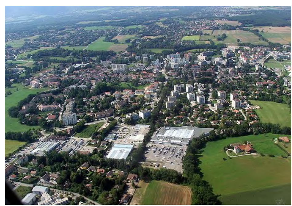
Ferney-Voltaire, near Geneva, is home to Crossroads Church.

Attending an international church challenges its members to re-examine which Christian traditions are more ethno-cultural than biblical and to put aside personal preferences and