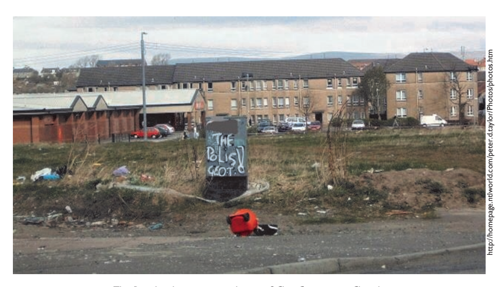
The Possilpark community, home of Clay Community Church

The act of rehabilitating the land is a clear, and often neglected way, of demonstrating the universal reign and rule of God through Jesus Christ. God does not just reign over humanity but reigns over creation as well. The Bible is unequivocal about the fact that God cares very deeply for his creation and