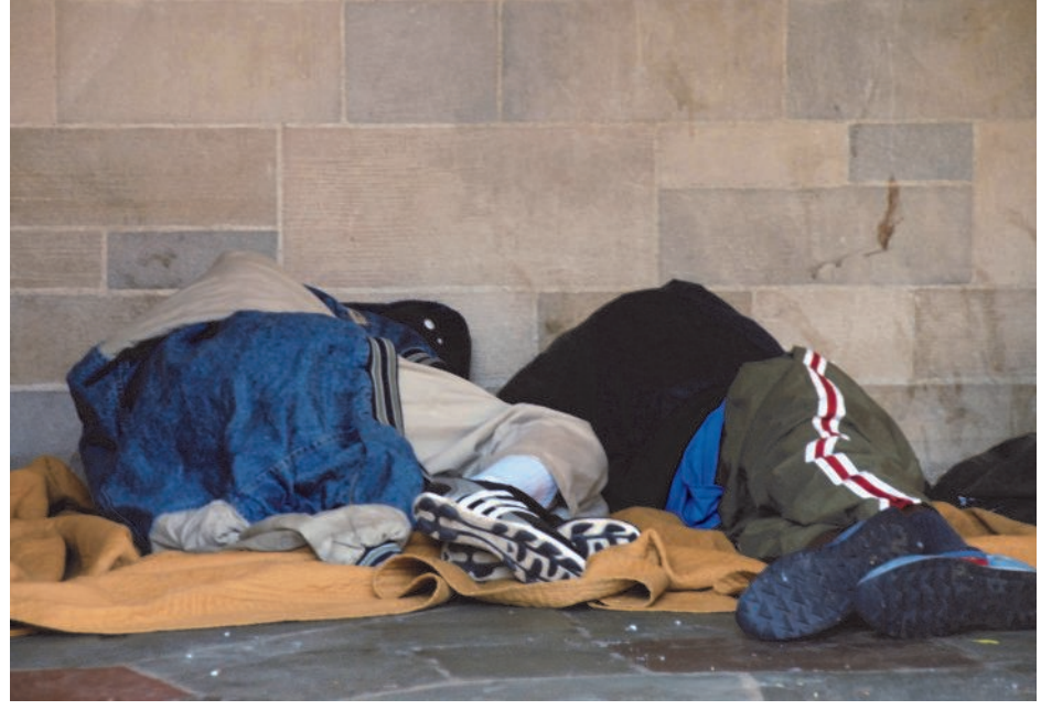
Homelessness among the migrant community is on the rise in London

The potential for LCM to contribute to such 'forming' of the human as an individual