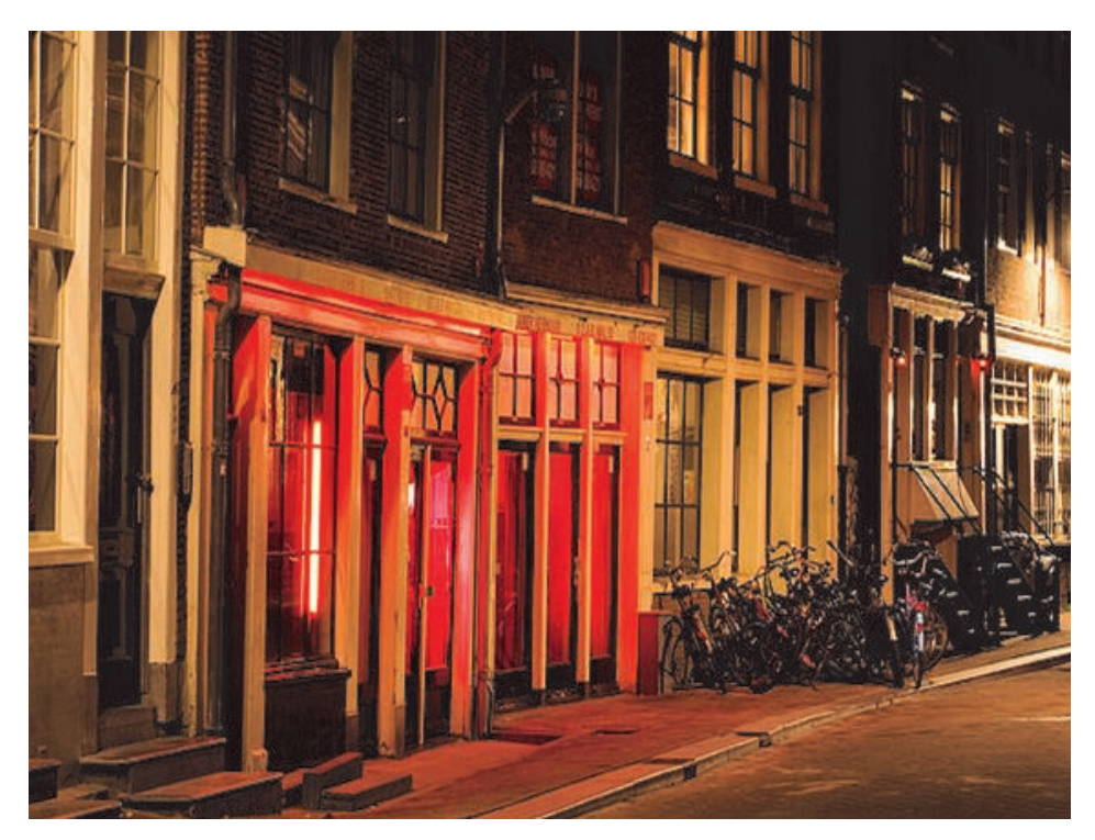
A view of two brothels in a small street in Amsterdam's Red-light district, also known as the "Wallen

However, despite the admirable efforts and missiological approaches of the three examples, there are some areas of their approach that raise some legitimate questions about their overall methodologies. For example one question to be asked with regard to Paul Ede and his church's work in Possilpark is: to what extent are they engaging with their community beyond the narrow focus of eco-mission? The state of derelict land is only one factor that contributes to the aforementioned 'Glasgow Effect'. In light of Jesus' announcement in Luke 4:18-19 (which is connected to Isaiah 61 and which Paul himself quotes as a Christological impetus for what they do) it is simply not enough to only care about the land. The whole gospel affects the whole person not just one aspect of the person's context.