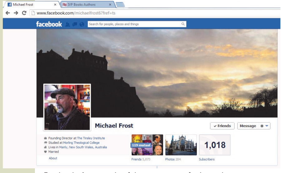
Facebook: An example of the excarnation of relationships