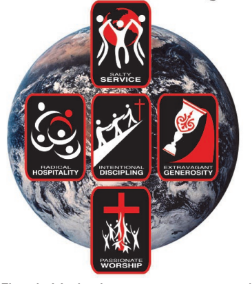
Florida Methodists measure missional vitality similarly to McNeal by counting numbers of people involved in five areas of missional vitality.

Whether our starting place is the four marks of the Creed or Hirsch's six elements of missionalDNA, if we genuinely want to measure "missional" it will require new measures, perhaps even unique measures for each local situation. Clearly this will involve each "missional" initiative engaging in a deep reflection both on the eternal values of Christian community revealed in God's word and on the local qualities that must be embodied for effective incarnational witness. Only then will our metrics correspond to our contextual realities. Only then we will get beyond counting heads, congregations or arbitrary values. Only then can we truly measure Jerusalem, as Zechariah was invited to do, with anything like the dimensions of the Spirit.